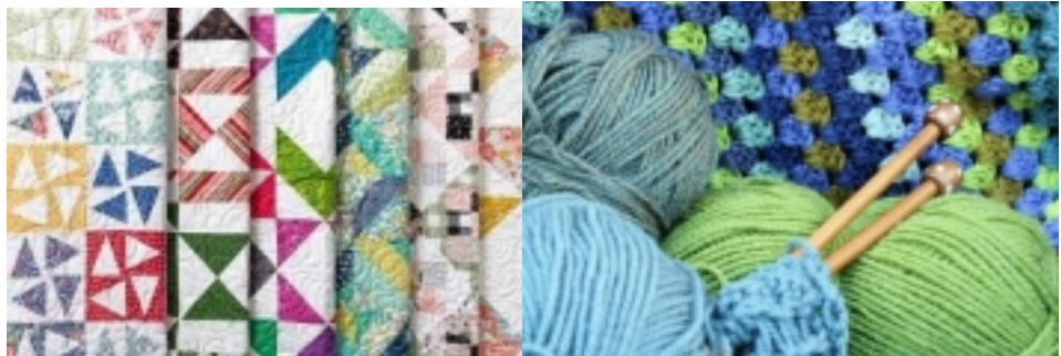
knit and crochet quilt tie

*Call or email us for the zoom link 860 646-7349 or bmlreference@biblio.org . The video will be available on our website starting December 1st.