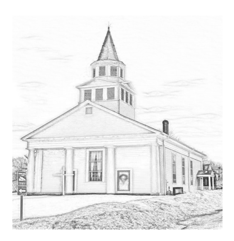
United Methodist Church of Bolton 1041 Boston Turnpike, Bolton CT 0604 http:/UnitedMethodistChurchBolton.org