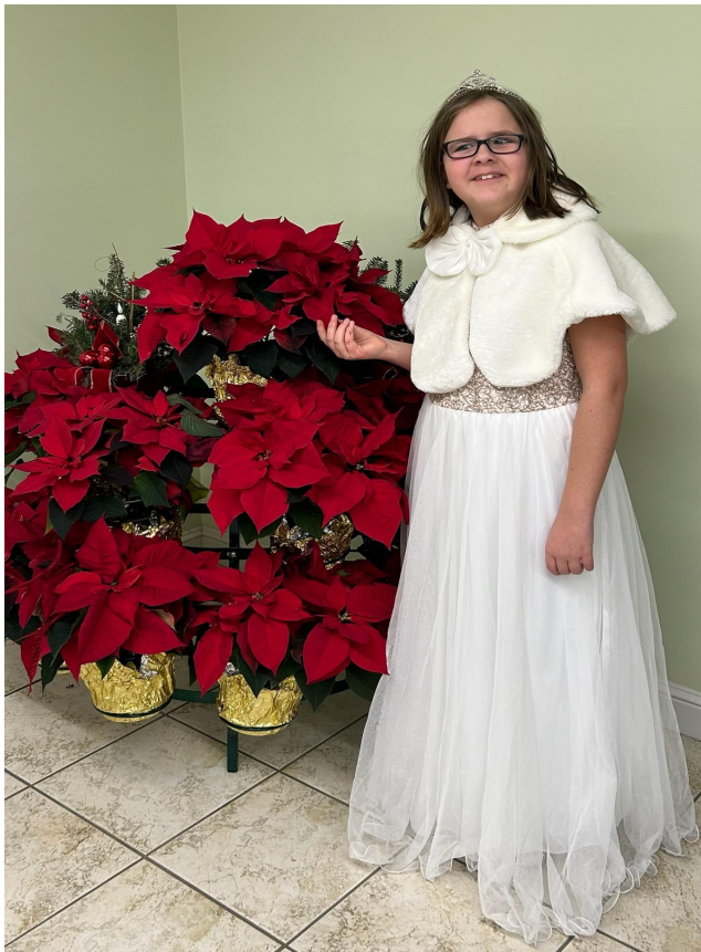
Our Xmas angel next to beautiful arrangement donated by Mt. Zion.