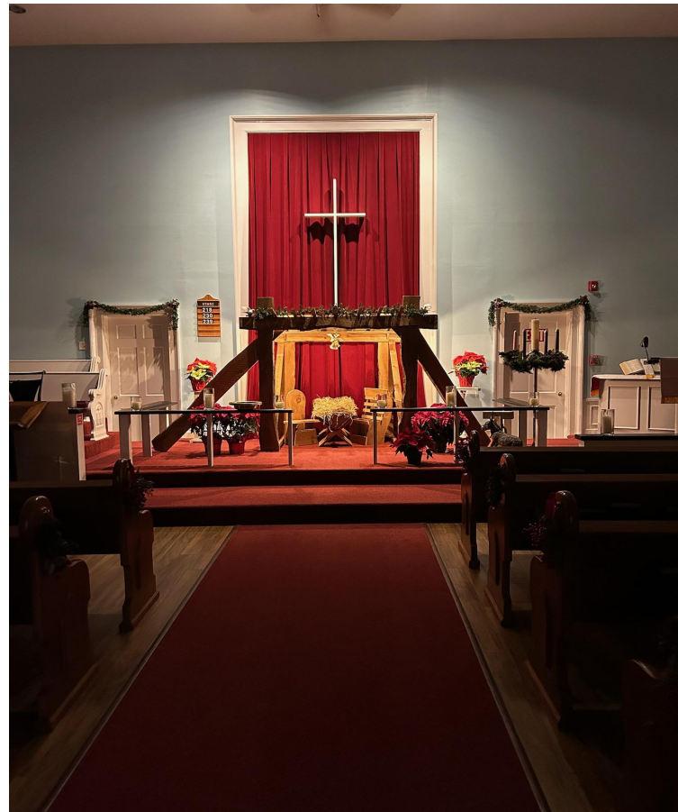
Thanks to all for a wonderful year!