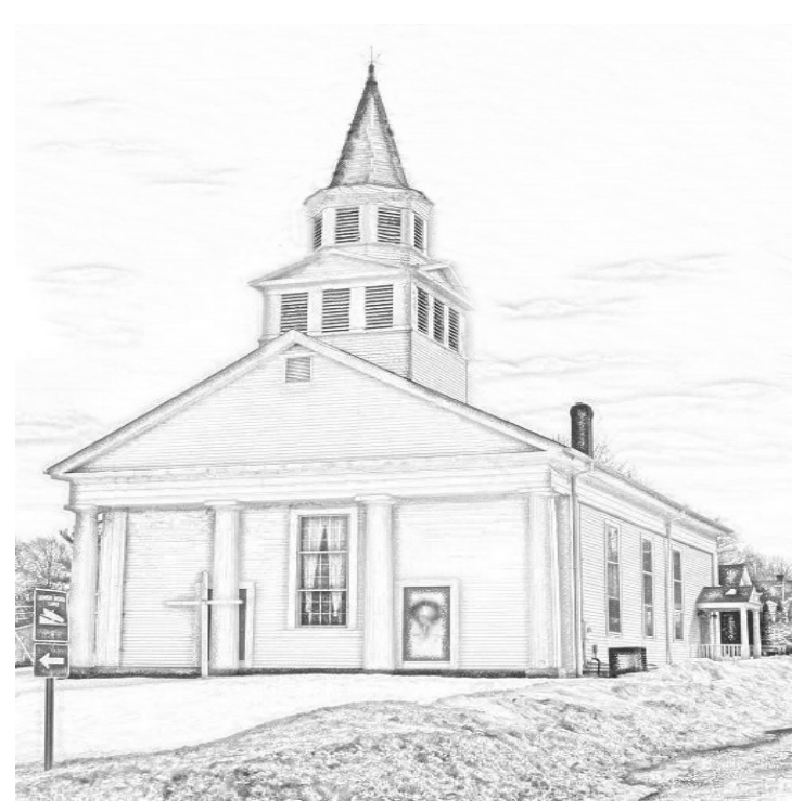
United Methodist Church of Bolton 1041 Boston Turnpike, Bolton CT 0604 http:/UnitedMethodistChurchBolton.org