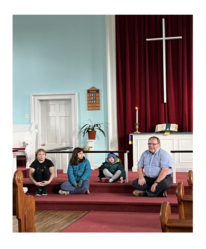
Childrens worship time.