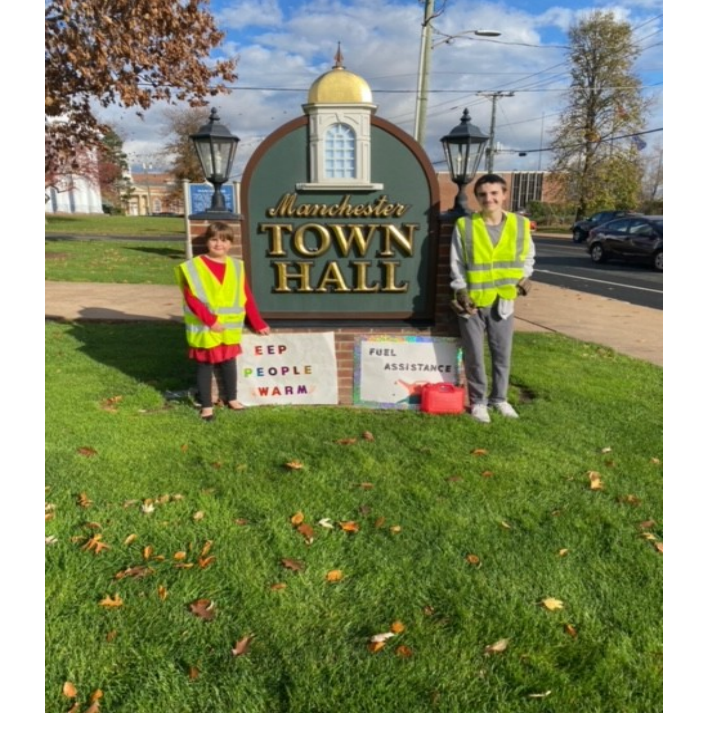
Youth Group meets every Sunday at North United Methodist church at 5:00-7:00pm