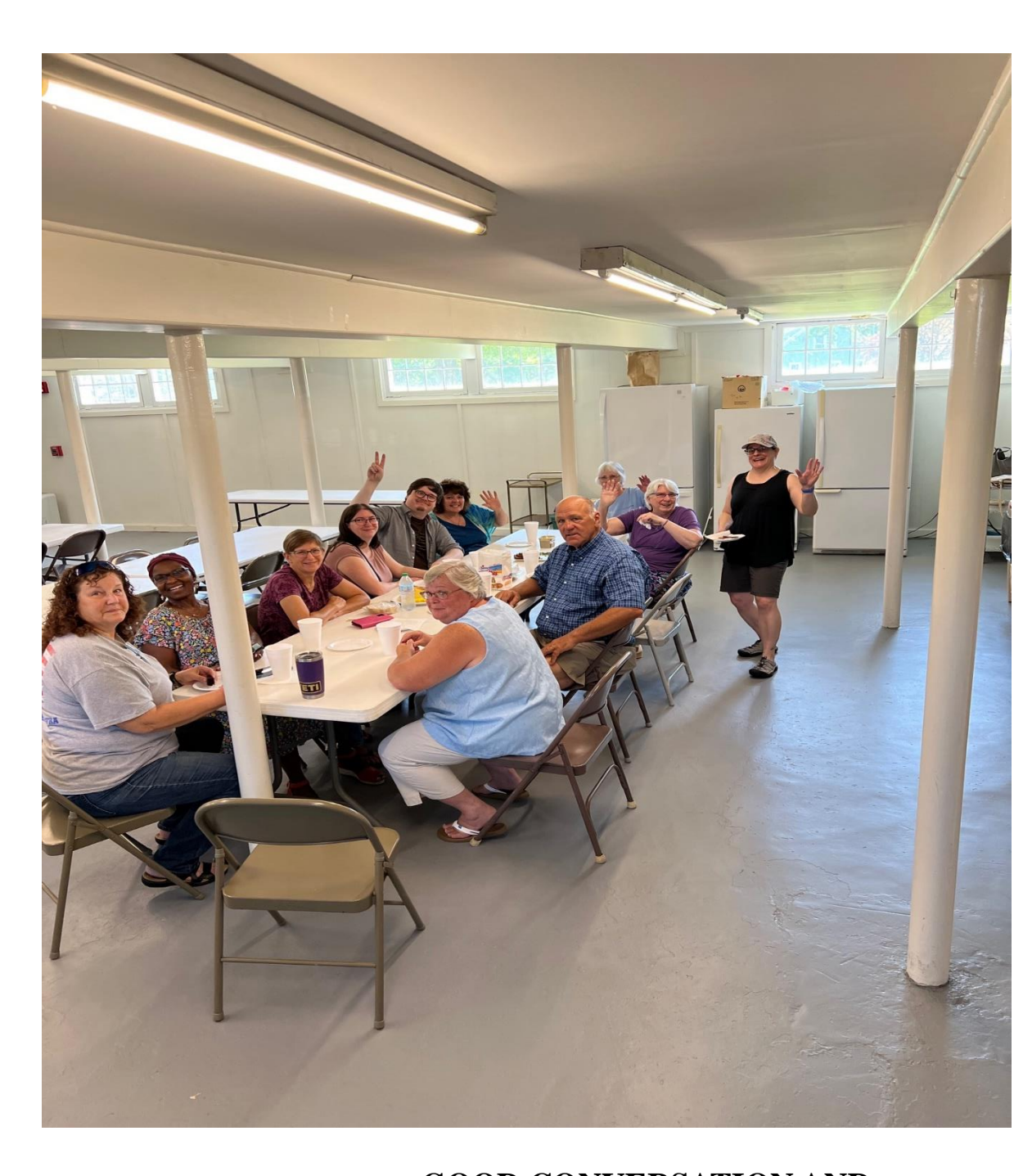
GOOD CONVERSATION AND FELLOWSHIP AFTER CHURCH