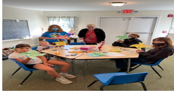
Childrens Sunday school continues. to see you all

It is from 9:15-9:45. Hope to see you all there. Praise the Lord and bring the children!!!